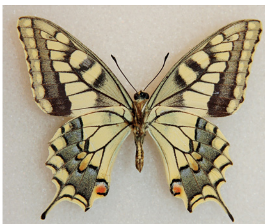
2. Papilio saharae saharae Oberthür, male. Collection label: 'Tunesia, Hamman, Sousse. 5.ix.1990'. The length of the fore wing is 34.5 mm. Left: upperside, right: underside. 2. Papilio saharae saharae Oberthür, man. Collectie-etiket: 'Tunesia, Hamman, Sousse. 5.ix.1990'. De voorvleugellengte is 34.5 mm. Links: bovenzijde, rechts: onderzijde.