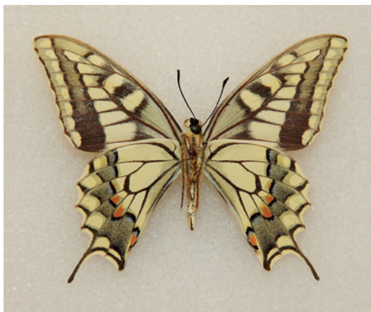
1. Papilio saharae saharae Oberthür, male. Collection label: 'Italia, Sicilia, Lentini 20.ix.1978. don H. v. Oorscot'. The length of the fore wing is 34.5 mm. Left: upperside, right: underside. 1. Papilio saharae saharae Oberthür, man. Collectie-etiket: 'Italia, Sicilia, Lentini 20.ix.1978. don H. v. Oorscot'. De voorvleugellengte is 34.5 mm. Links: bovenzijde, rechts: onderzijde.