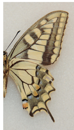
4. Papilio machaon sphyrus Hübner, male. Collection label: 'Sicilia, Trápani, Bresciana. 25.ix.1971'. The length of the fore wing is 40 mm. Left: upperside, right: underside. 4. Papilio machaon sphyrus Hübner, man. Collectie-etiket: 'Sicilia, Trápani, Bresciana. 25.ix.1971'. De voorvleugellengte is 40 mm. Links: bovenzijde, rechts: onderzijde.